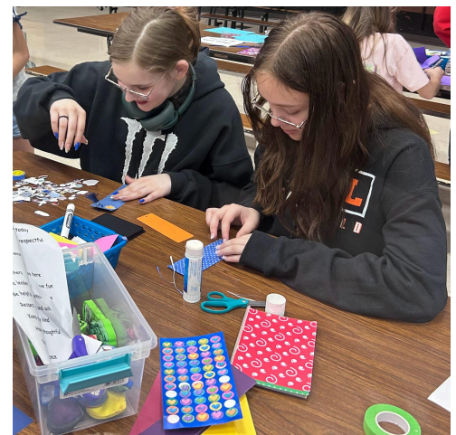
Two youth are working on bookmarks for the library.

Oriole Sparks: Service Learning was a six-week experiential learning program that engaged 21 sixth- through eighth-grade students at Bessie Allen Middle School in meaningful, hands-on service projects designed to build youth skills while addressing local community needs. Guided by a survey administered by Extension staff to identify student interests, the program was intentionally aligned with what youth cared about most, increasing engagement and relevance. In collaboration with the school’s activities director, participants explored their personal sparks and worked together to plan and carry out a variety of service projects, including making dog toys for a local animal shelter, creating no-sew blankets for a homeless shelter, designing positive message posters for the community pool, producing bookmarks for the public library, and beginning a community scavenger hunt project. Through these activities, youth strengthened communication, teamwork, empathy, and problem-solving skills while gaining confidence in their ability to make a positive difference. The partnership with Bessie Allen Middle School helped expand access to 4-H programming for youth who may not otherwise participate, supporting equitable access and reinforcing Extension’s role as a trusted partner in youth development and community engagement.