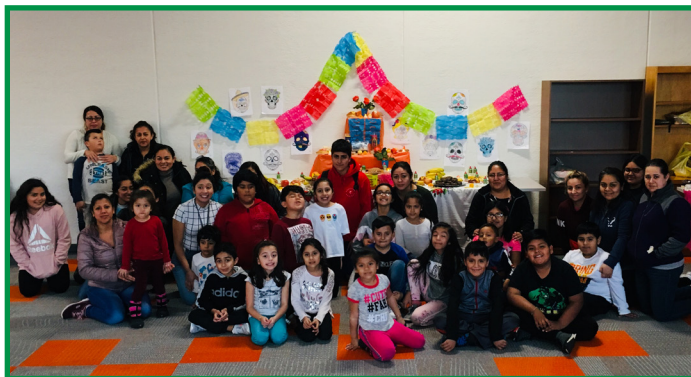
Members of Los aviones internacionales learn about la Dia de los muertos (the day of the dead).

The group continues to offer educational programming for Latino families. These families are getting a better understanding of 4-H in a way that honors their heritage.