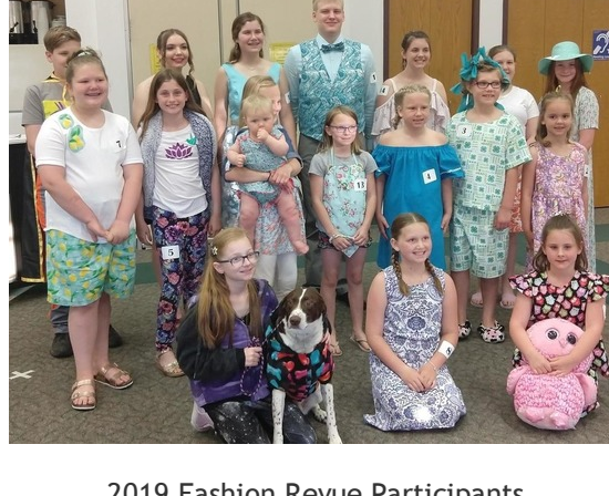
2019 Fashion Revue Participants

https://winnebago.extension.wisc.edu/4h/projects/sewing/fashion-revue/