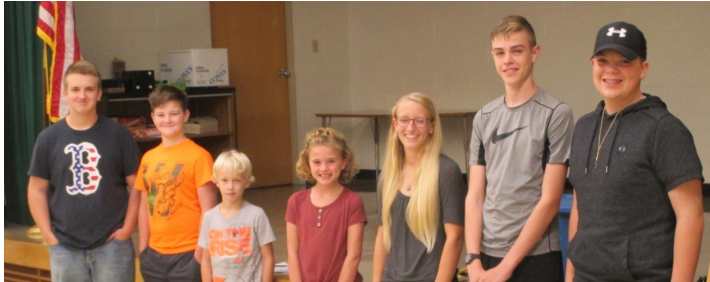
Brandon Tanagers 4H Club Officers 2019/2020