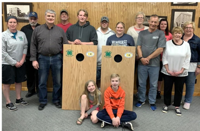
Members of the Lion's Club, Waupun Recreation Board, and Representatives from Weeping Willow 4-H Club displaying two of the boards