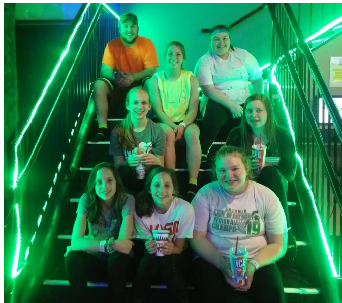
TLA members went to Xtreme Air in May