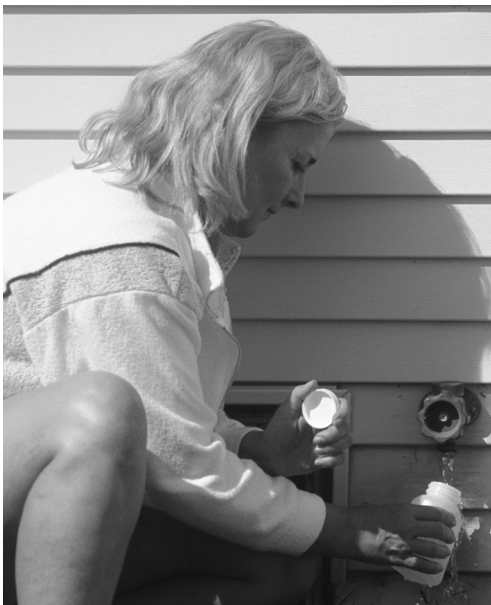
Photo Credit: "Drinking Water" by Wisconsin Department of Natural Resources on Flickr.com

Follow any recommendations to protect the safety of your drinking water. Ask UW-Extension your questions.