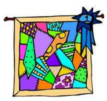
<u>Inclusion Quilt</u> Camryn Krause, VISTA, UW-Extension Fond du Lac County