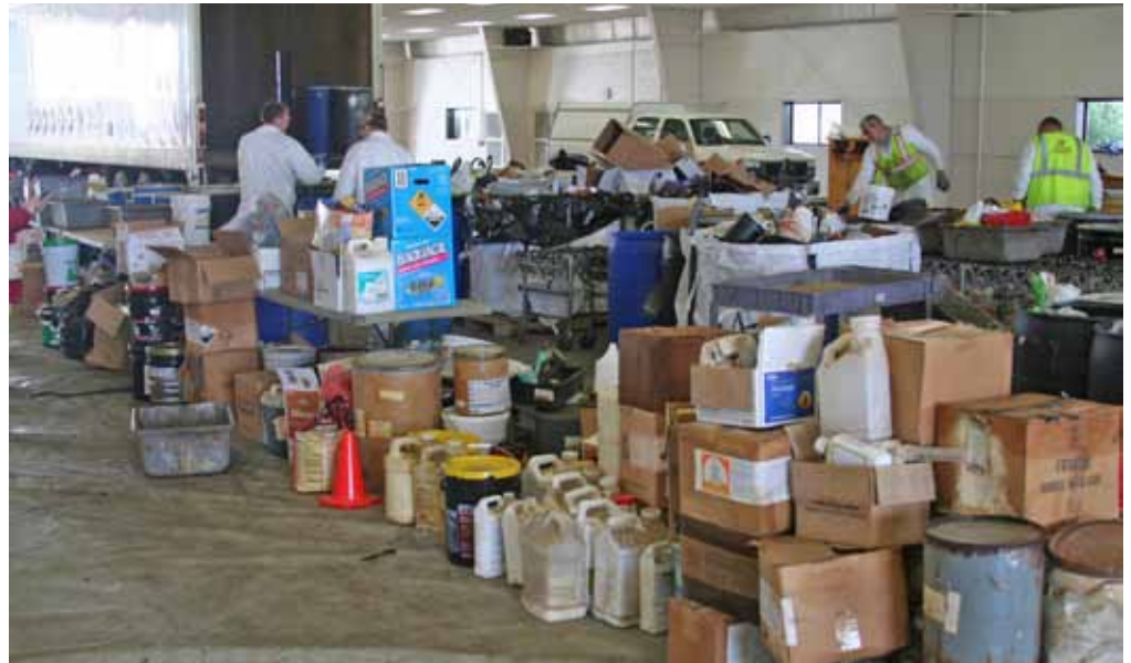
Ten tons of hazardous waste were diverted from landfills and groundwater

team has met four times and initiated a short newsletter to educate co-workers about energy issues at work and at home.