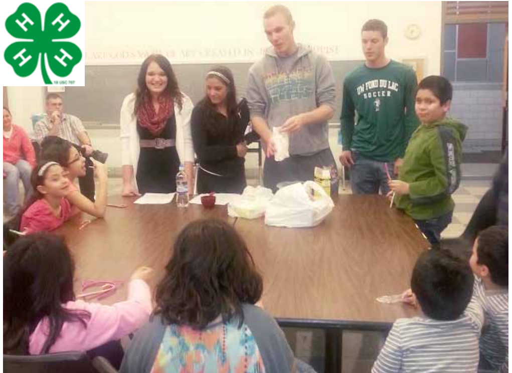
UW Fond du Lac students present science activities at Young Dreamers 4-H club meeting.

“I learned that kids love to have fun, no matter what the case is. I also learned how to incorporate myself as a role model around individuals who look up to me. Overall I had fun with the kids, and I learned how to appreciate the smaller things in life that get overlooked.”