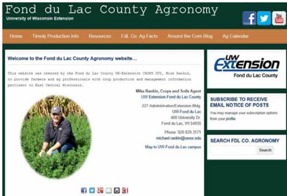
Retooling: cutting edge agronomy info is delivered electronically