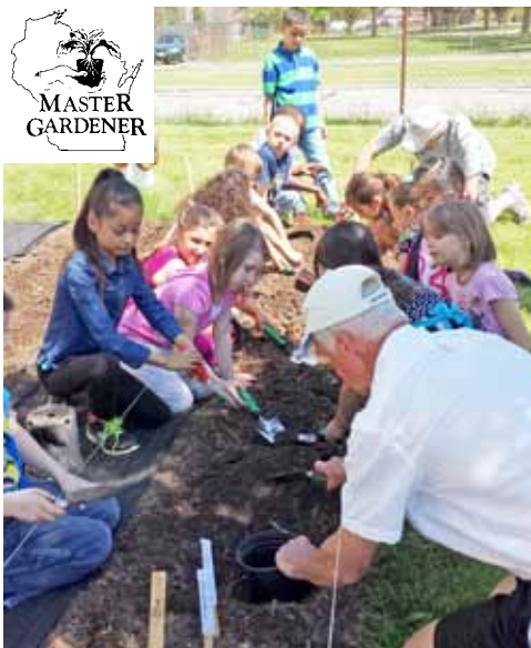
Master Gardeners working with elementary students to prepare a garden plot

The Master Gardener Volunteer Association is a group of committed individuals with a passion for horticulture, education, and public service. Members are required to maintain an annual commitment of 24 hours of community volunteer time and 10 hours of continuing education. They maintain a number of the gardens on the UW-Fond du Lac campus and various gardens in the community. They also work on garden projects at area elementary schools and answer many of the horticultural questions that come into the UW-Extension office. Their commitment to the community and UW-Extension resulted in nearly 5800 hours of volunteer service provided in 2014.