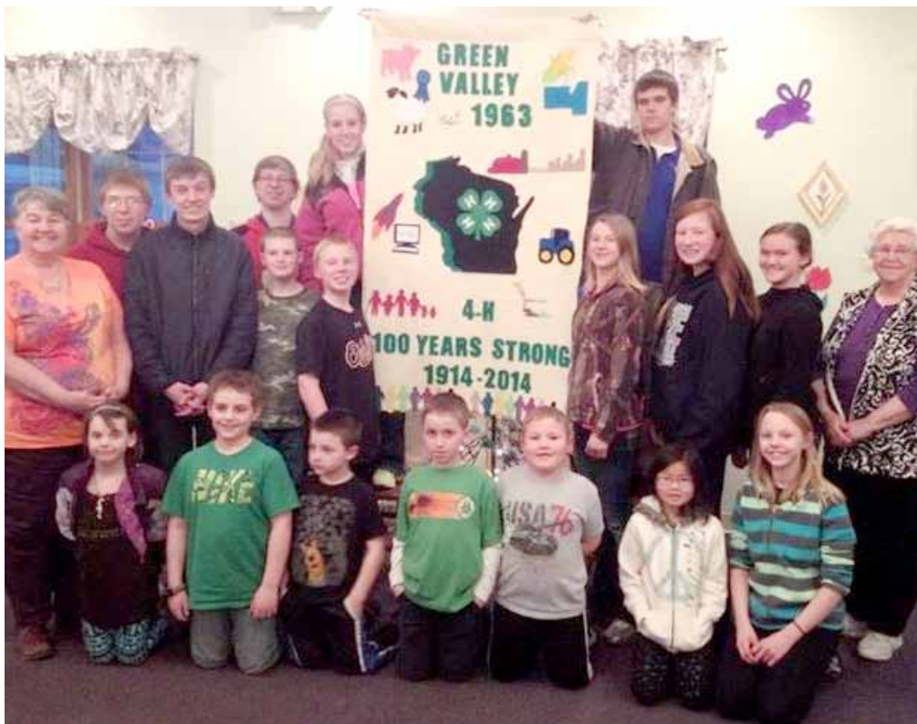
Green Valley 4-H members display their new club banner created to commemorate the WI 4-H centennial.