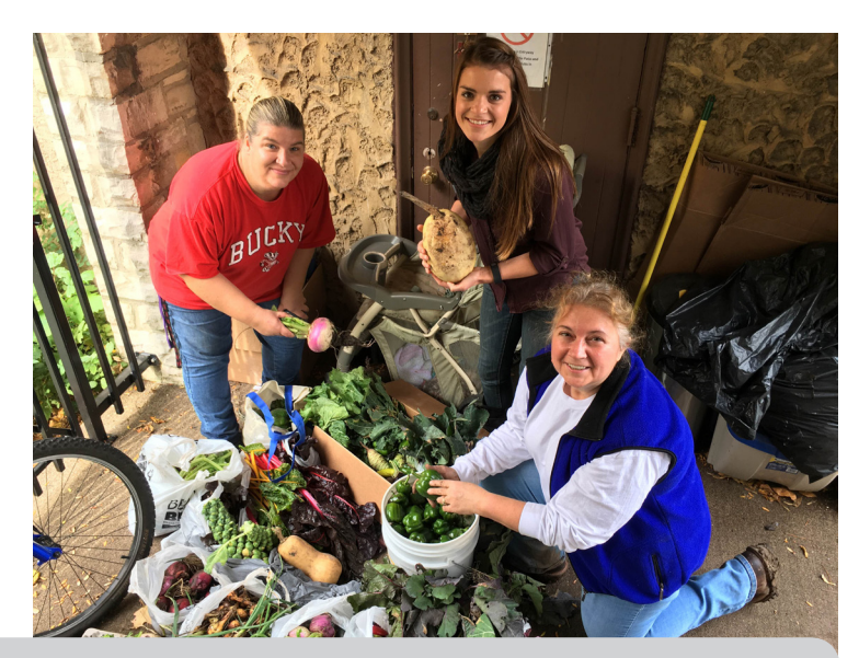
In 2016, 85 families rented garden plots, 20 of these families were 1st time gardeners.